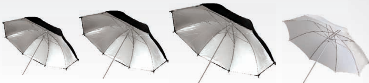
Reflector Broli DU-33BS 33"