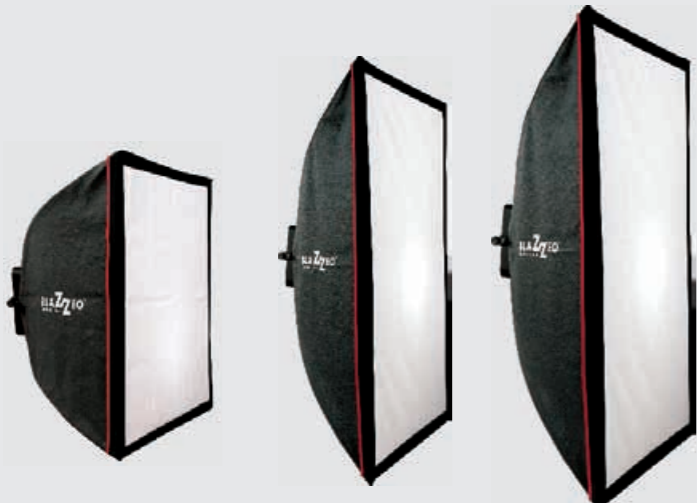
QuadSoft Sb6060 60x60cm