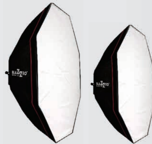
OctaSoft SBO150 Φ150